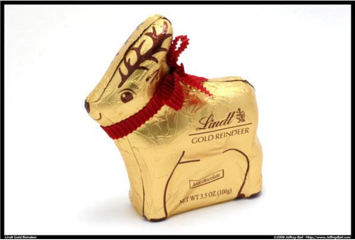
Another Result of the above light box