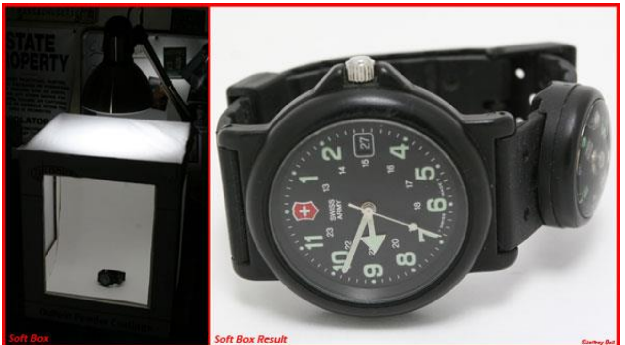
The Light box in action